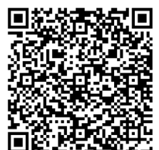
Just Giving Donations Page

The Family Food Bank is part of the Children & Families Charity Group.