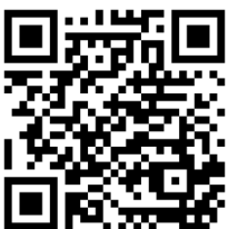
Xmas Appeal 2023

For more information on this years appeal please visit